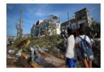
Lions are Providing Lifesaving Aid to Hurricane Victims