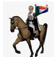
ARISE LADY HELEN