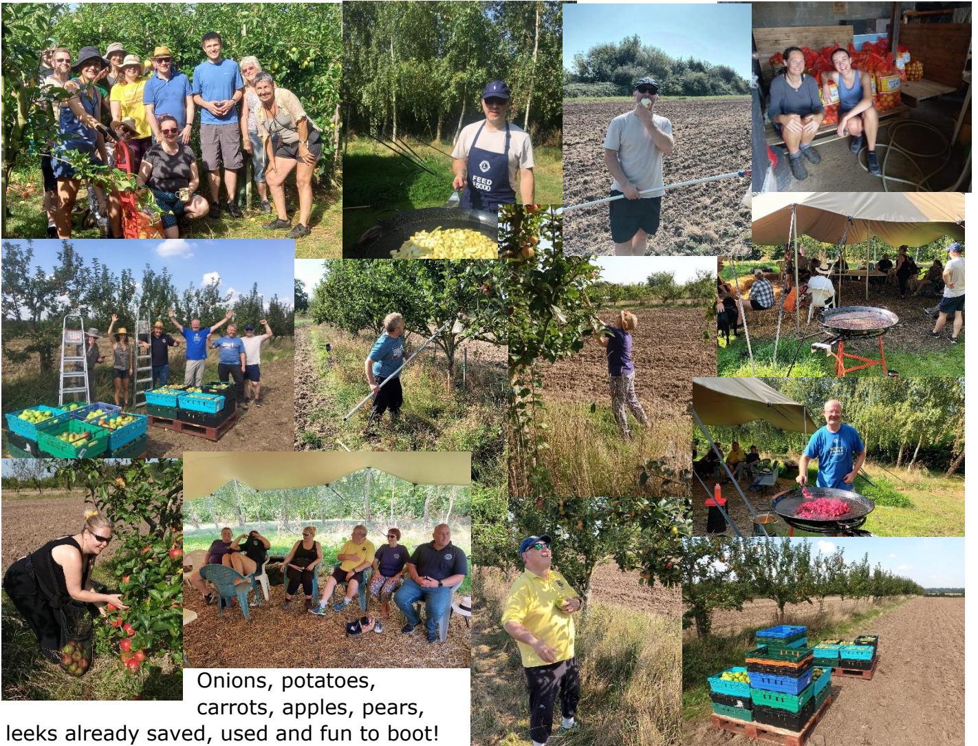
Onions, potatoes, carrots, apples, pears, leeks already saved, used and fun to boot!

Not done any gleanning this year? Why not join in with a group near you and help use fruit and vegetables otherwise left to rot, help those in need and have fun as well.